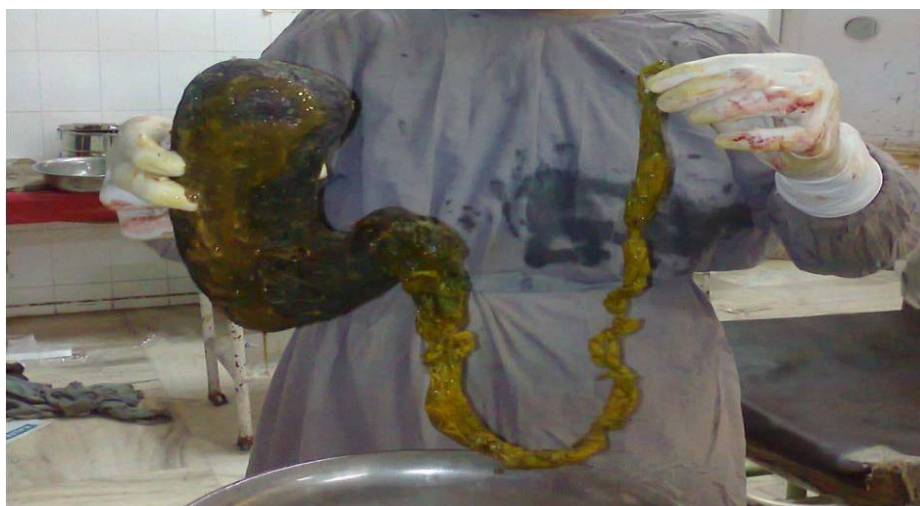
Figure 2: The Trichobezoar alongwith its tail